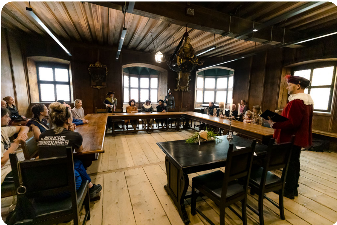
Start of the WBF – Location Assignment for Artists

The festival also offered a rich program full of creativity: workshops, live music, and spontaneous jam sessions created a free space for exchange, playfulness, and artistic freedom – all without pressure to perform.