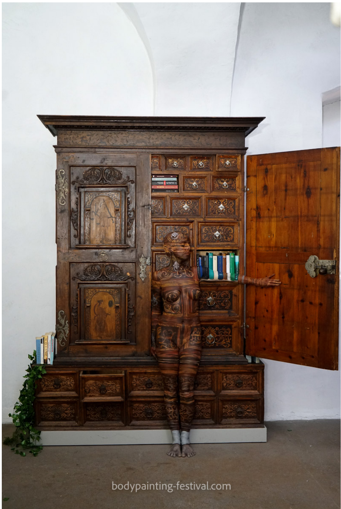
Camouflage by Elena Tagliapetra